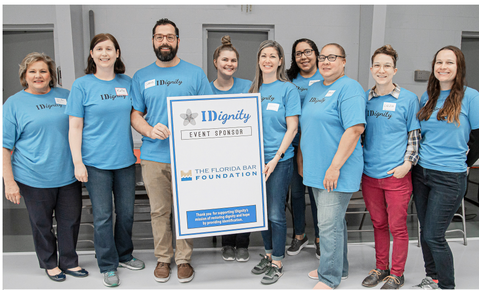
Florida Bar Foundation staff members volunteered at IDignity's monthly identification clinic in January. IDignity, a Community Economic Development grantee, helps people obtain driver's licenses, birth certificates, Social Security cards and more.